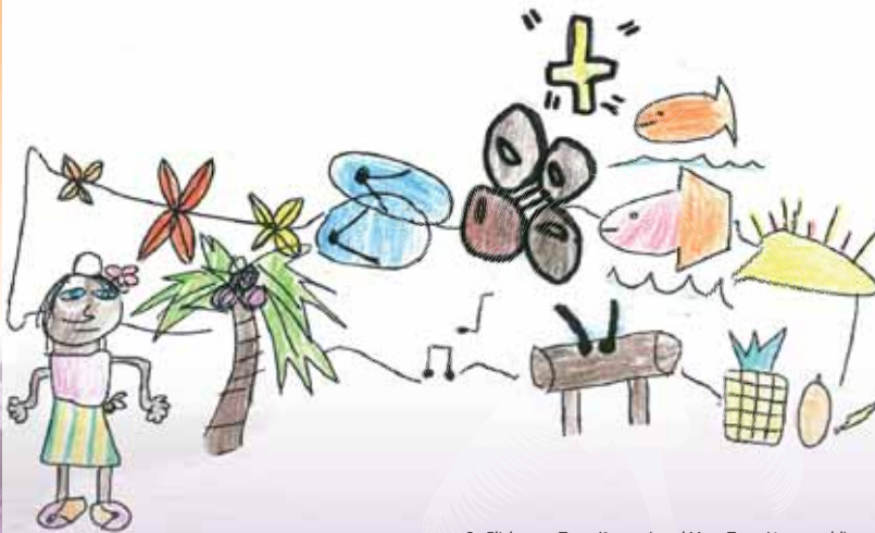
By Elisharma Tapu (9 years) and Myra Tapu (4 years old)

Pacific health is flowers, jandals, coconuts, fish, sunsets, tropical fruit, drums, music, palm trees, beautiful people and church.