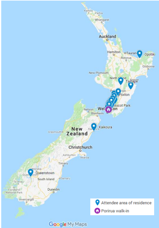
Figure 3. Map of Porirua walk-in participants’ residence across New Zealand.